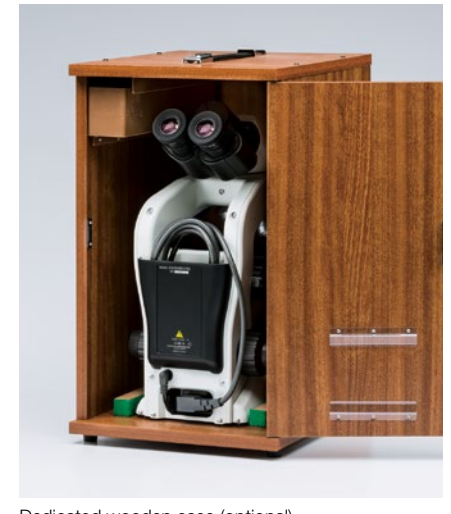
Dedicated wooden case (optional)