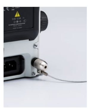
Built-in security slot