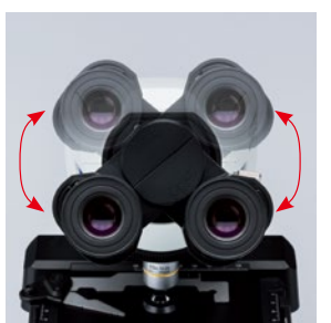
Evepoint height adjustment