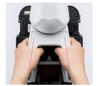
Angled arm enables comfortable