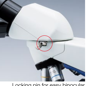
Locking pin for easy binocular