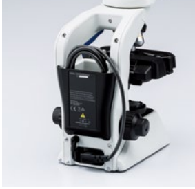
Convenient and easily accessible power cable storage