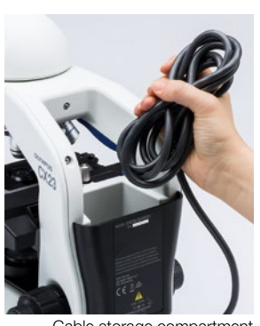
Cable storage compartment