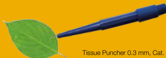
Tissue Puncher 0.3 mm, Cat. No. F-200S

The Thermo Scientific™ Tissue Puncher 0.3 mm is a convenient tool for cutting very small punch discs from materials such as animal tissue, plant leaves, or Whatman™ cards. The discs obtained are of an ideal size for direct PCR protocols.