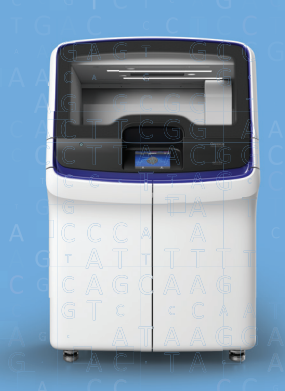
Genexus Integrated Sequencer