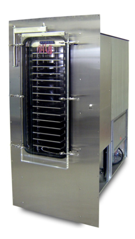
(Cleanroom configuration 50L Ultra EL shown)