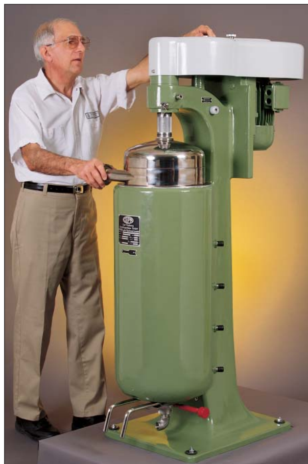
Model Z81, a large production centrifuge, processes volumes from 100 to 2,000 liters depending on solids content.

As powerful as the Z81, and with a 25% larger cylinder capacity, the Z101 is typically used with 150 to 600 liter process volumes. Maximum throughput is 3,000 liters/hour.* Model Z101 is shown below; enclosed Z101G is pictured on page 1, bottom row.