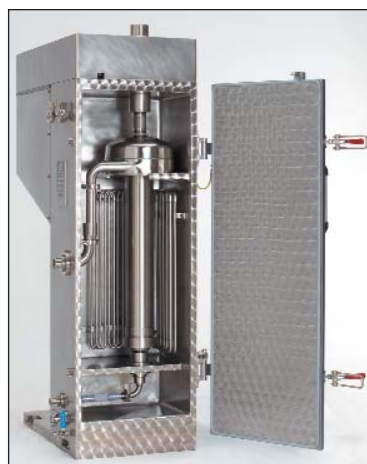
Enclosed Model Z61G