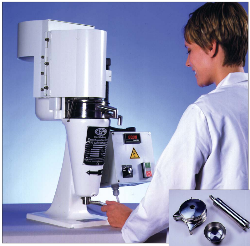
Model LE Benchtop centrifuge for lab scale separation of process volumes from 1.5 to 15 liters. Accessories are easily added or removed without need for tools, for rapid set up and clean up.