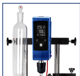
High Torque Overhead Stirrer OHS.4