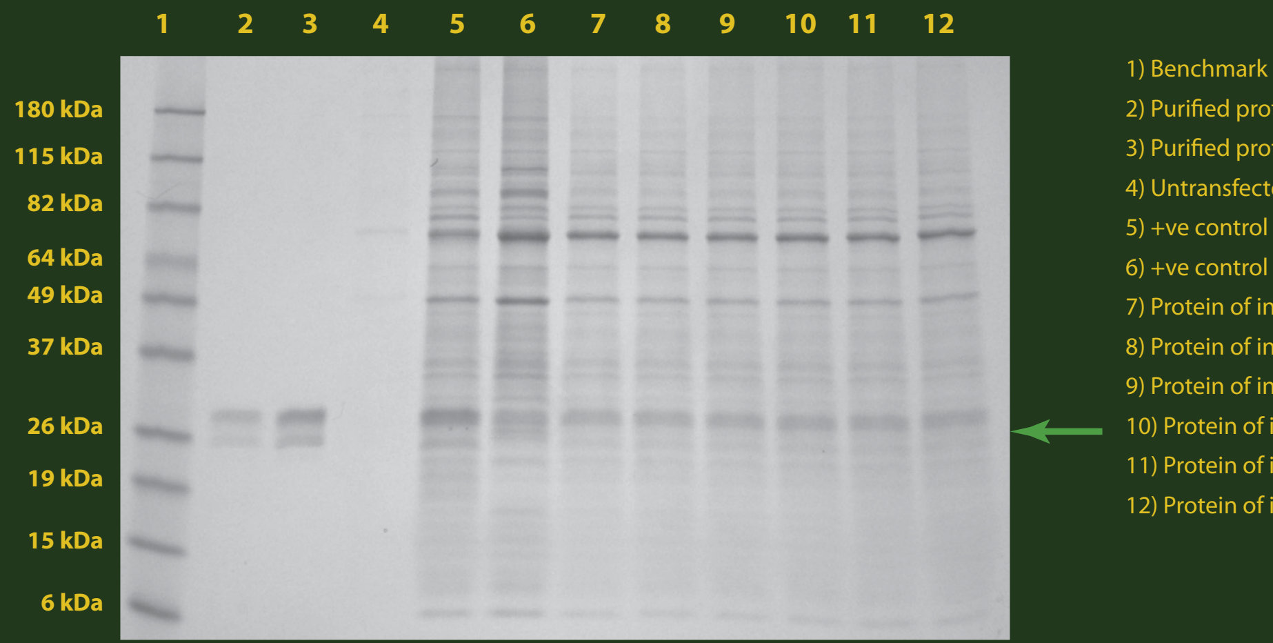
4-20% SDS-PAGE Quick Blue Stain Commassie Gel

This gel shows equal bands from 5 replicates of a low expressing protein, producing roughly 10 to 20 mg/L.